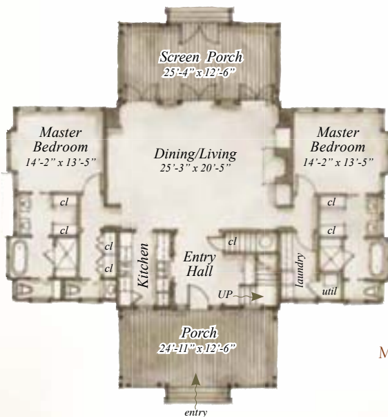
MAIN FLOOR 1,961 S.F.

Plans are available on a limited basis. All dimensions are approximate.