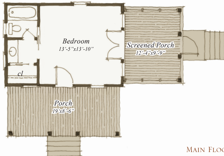
MAIN FLOOR 280 S.F.