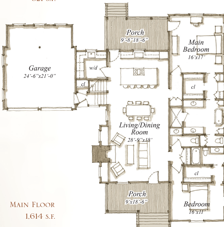
MAIN FLOOR 1,614 S.F.

Plans are available on a limited basis. All dimensions are approximate.