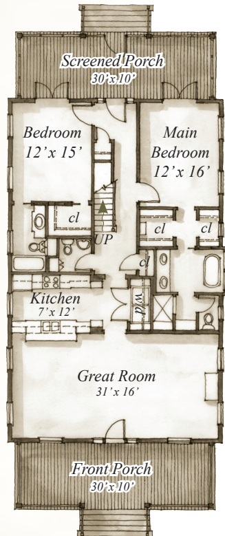
MAIN FLOOR 1,664 S.F.