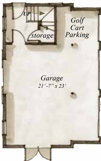
MAIN FLOOR 718 S.F.