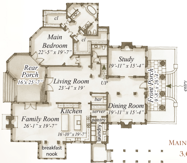
MAIN FLOOR 3,686 S.F.

Plans are available on a limited basis. All dimensions are approximate.