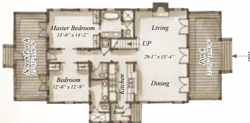
MAIN FLOOR 1,434 S.F.

Plans are available on a limited basis. All dimensions are approximate.