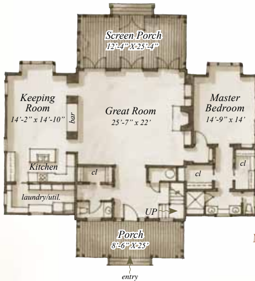
MAIN FLOOR 2,073 S.F.

Plans are available on a limited basis. All dimensions are approximate.