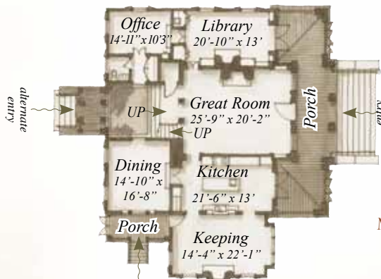
MAIN FLOOR 2378 S.F.

Plans are available on a limited basis. All dimensions are approximate.