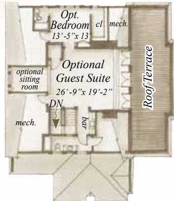
OPTIONAL ATTIC FLOOR 1210 S.F.