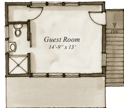
UPPER FLOOR 300 S.F.

Plans are available on a limited basis. All dimensions are approximate.