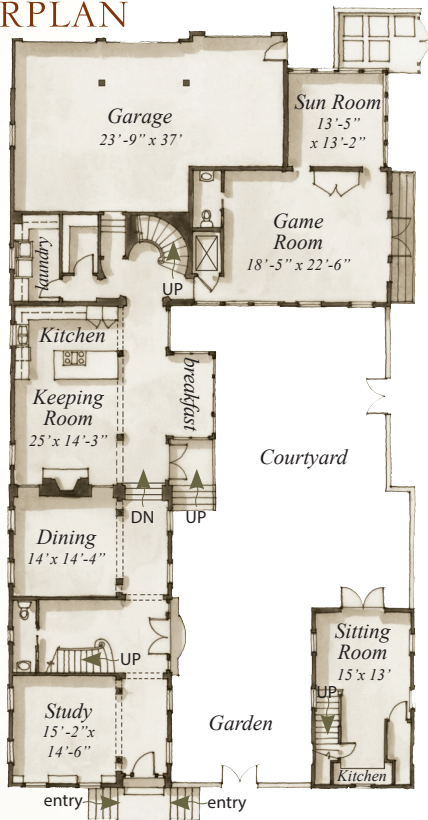
MAIN FLOOR MAIN HOUSE: 2,584 S.F. OPTIONAL GUEST HOUSE: 350 S.F.